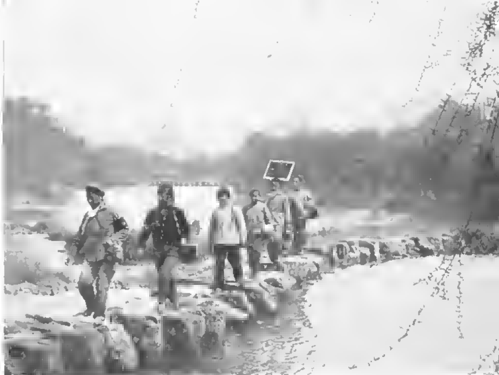
Medical workers in Kweichow province arrive at a village.

them in exposing and repudiating Liu Shao-chi's counter-revolutionary revisionist line of serving only a few and with an eye solely on profit. Then the workers put their energies into producing inexpensive, high quality, effective and easy-to-take medicines for common and recurrent diseases. At the same time, medicines urgently needed by the peasants are delivered in good time.